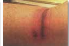
4 of February 2015