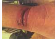
3 of February 2015