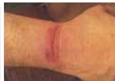
11 of February 2015