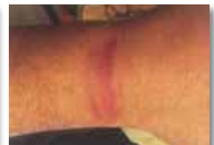
24 of February 2015